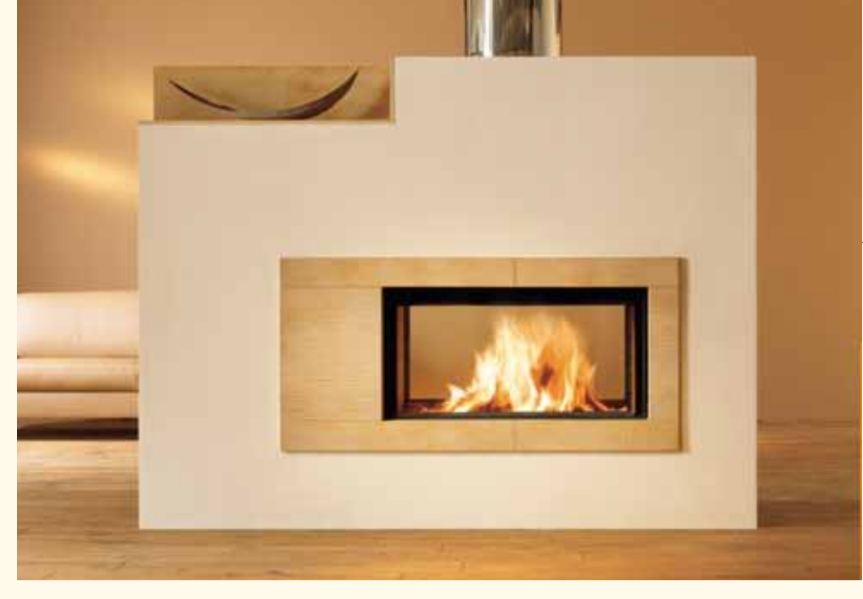
2044_3: fire frame smooth and flute lengthwise 240 Glaze: hemp light Technique: Spartherm — KE 137

2044_2: fire tiles MAXIMUS flute lengthwise 241 Glaze: solnhofen Technique: Spartherm __ KE 240