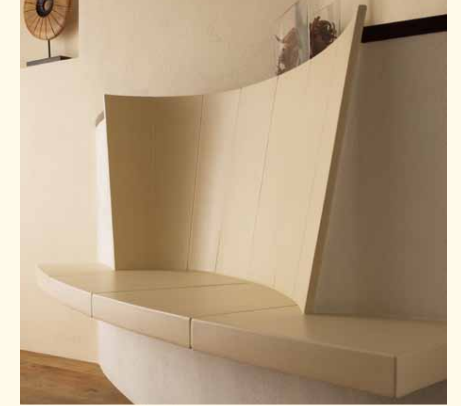
2047_1: backrest 378, fire shelf 179 Glaze: cocoa dark, perla Technique: Brunner KE 351

Tiles have particular qualities. They store heat and release it in the form of particularly gentle, healthy ceramic radiant heat. Heat which has long since been known for its healing, relaxing effect on our body. Beneficial and relaxing, this is the quality of tiles by Sommerhuber.